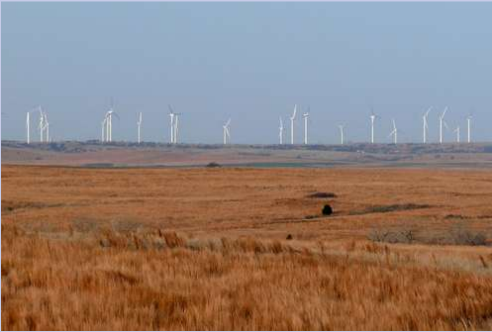
Wind Farms just beyond the Selman Ranch.

Click here for original information and registration form