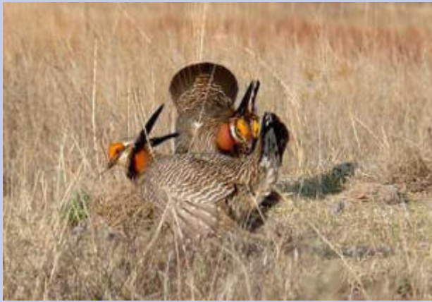
Some of the activity on the lek