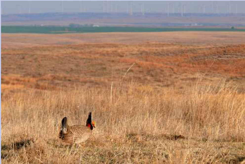
The view from the blinds. Note the looming threat of wind towers on the horizon.

Please scroll down to view photos and more details form the weekend.