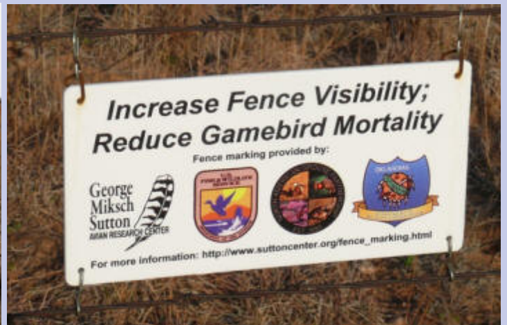
Some marked fence, along with a sign explaining it to the public.