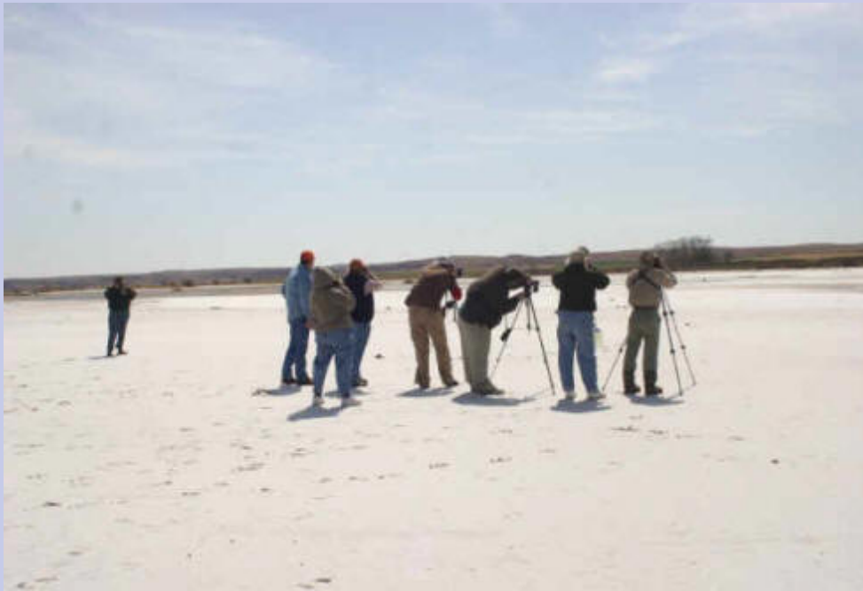
Birding on the salt flats area of the Selman Ranch. Snowy Plovers were the highlight here. Salt Flat photos by Sue Selman