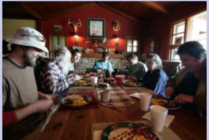
Breakfast at Sue's ranch house, followed by some well-deserved rest.